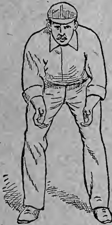
THE GOOD SHORT-SLIP.

cover-point, who lacked interest in the game and didn't know where to stand. There are shoals of such fieldsmen to be met with, and any one may be excused for thinking that one more of the genus is before him. Soon a gentle hit is made toward cover. The field trots very slowly toward it, but on his toes, and eying the batsman meantime, till he hears the welcome words "Come on" uttered after a short but fatal hesitation. Then,